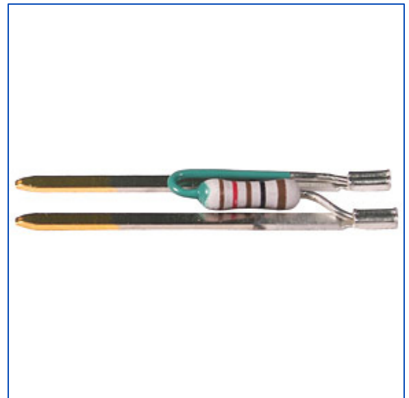
Delphi J1939 Terminating Resistor